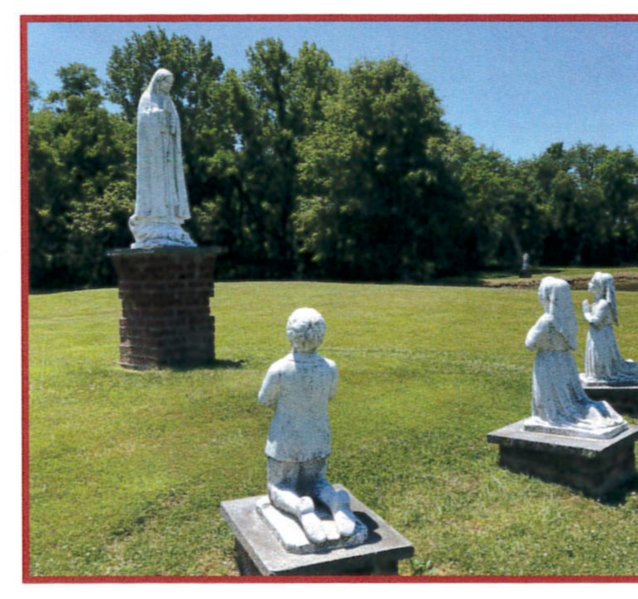
Our Lady of Fatima Statues

"The new Chapel and Conference Center are excellent, as well as the food! The Conference topics were well selected and pertinent."