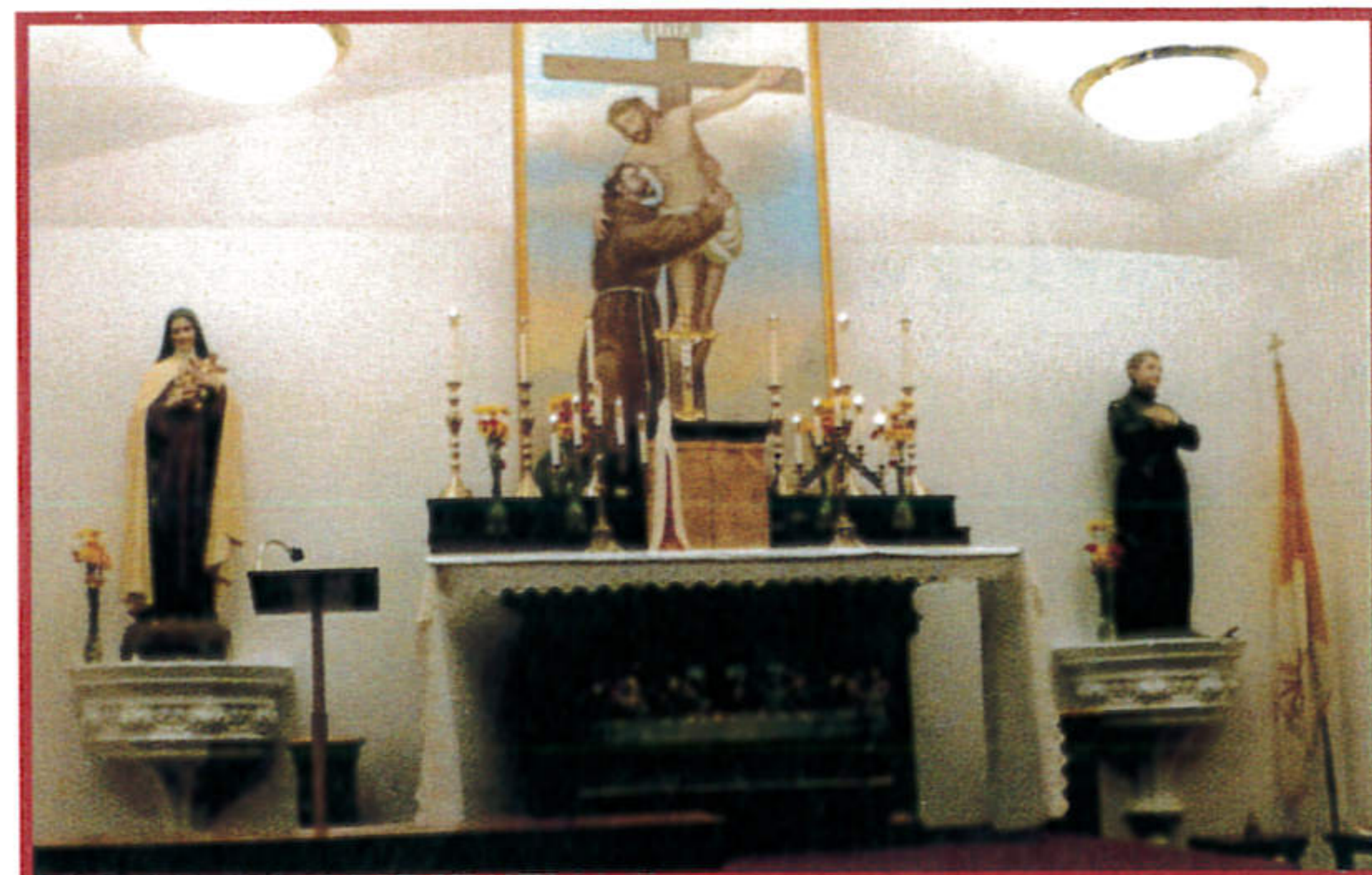
The Altar in the Chapel

“I found the silence kept to be very beneficial. I will recommend it to others.”