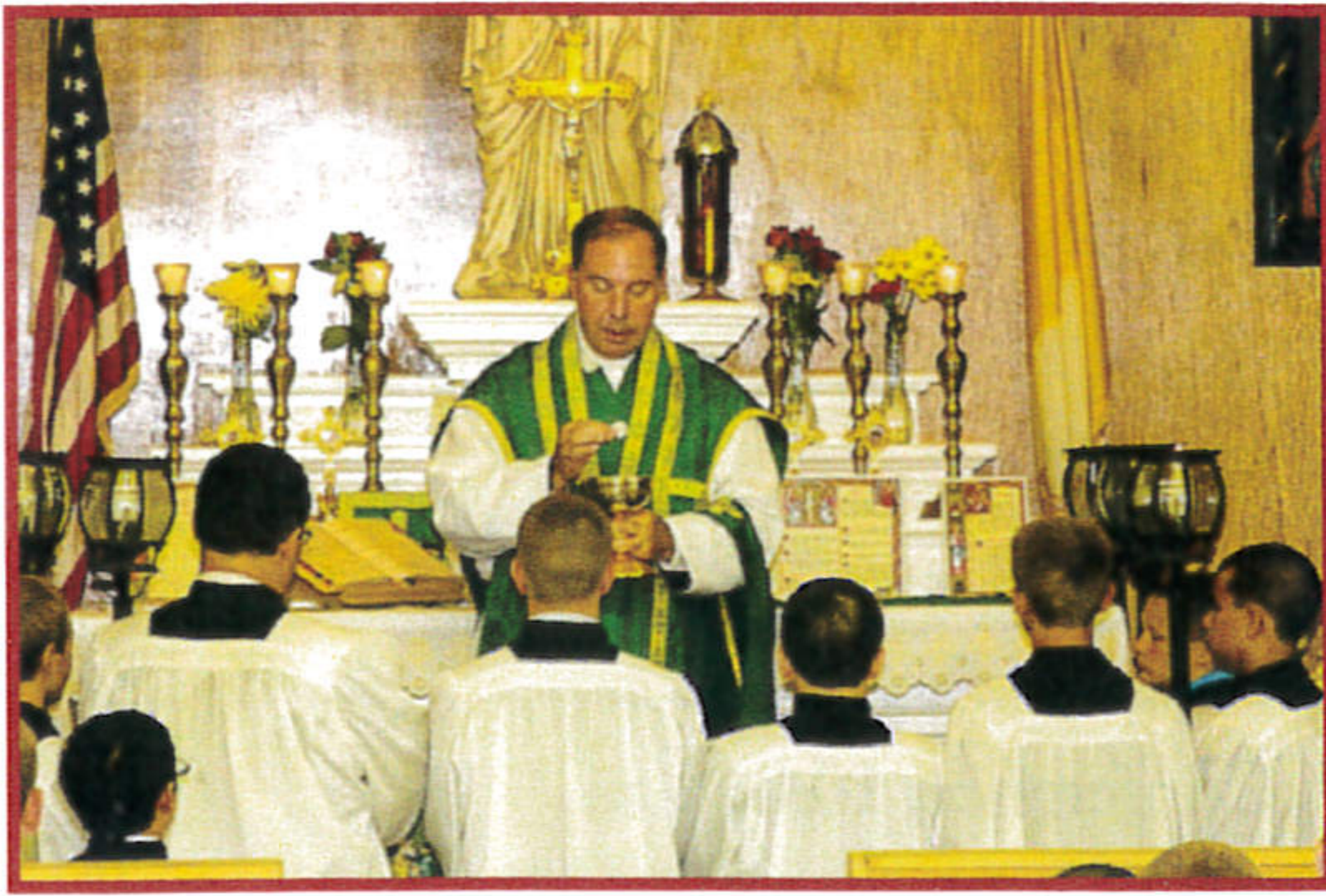
Holy Communion in the Chapel

“Best retreat in every way; didn’t want retreat to end. Many ladies who have never been to one don’t know what retreats are and what they are missing.”